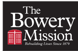
2. Primary Inverted