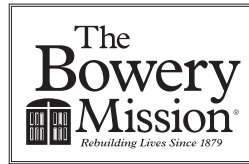
3. Primary B&W