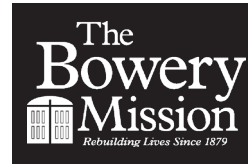
4. Primary B&W Inverted